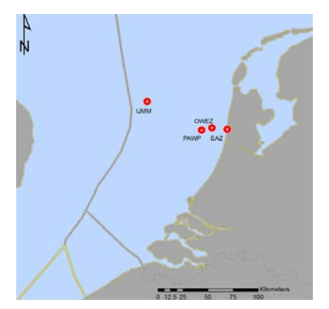
Monitoring sites in 2014

atmospheric pressure). During the whole season in 2013 bats were monitored in OWEZ and PAWP. The same year a Nathusius's pipistrelle was found in Friesland, which was ringed in England